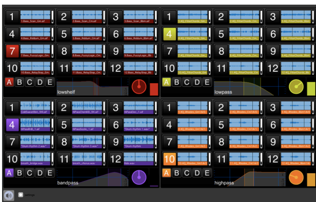
Figure 2. Master interface for all players in 4Quarters .

As has been the intent in several mobile phone projects [23, 24, 25, 26], 4Quarters is designed to be fundamentally collaborative, blurring the lines between composer, audience and performer. Presently the system can accommodate up to twelve players. A heads-up display from the server provides a central visual interface continuously updated with all user activity. Matching each user's assignment, the space is divided into four quadrants, each with its own color (Figure 2). If there are more than four players, various sound controls that correspond to single color may be divided amongst the players. Player color functions as a signifier for team coordination. For example, red player A may control volume, while red player B controls EQ.